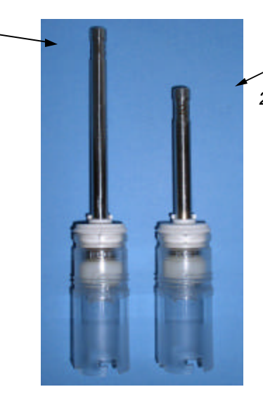
CAN BE USED TO REPLACE NYLON ENTRY TUBE VERSION